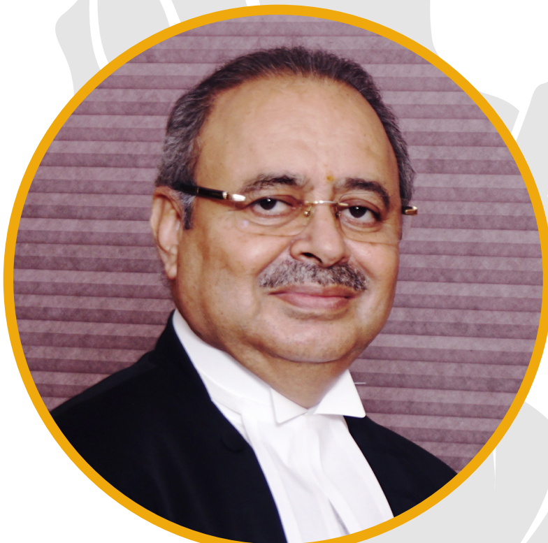
HON'BLE MR. JUSTICE RITU RAJ AWASTHI

HON'BLE UNION MINISTER OF STATE FOR ELECTRONICS AND INFORMATION TECHNOLOGY & UNION MINISTER OF STATE FOR SKILL DEVELOPMENT AND ENTREPRENEURSHIP, GOVT. OF INDIA