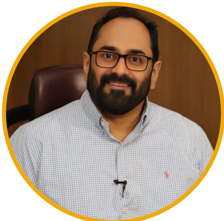
HON'BLE SHRI RAJEEV CHANDRASEKHAR

HON'BLE UNION MINISTER OF STATE (I/C) FOR LAW & JUSTICE, PARLIAMENTARY AFFAIRS AND CULTURE, GOVT. OF INDIA