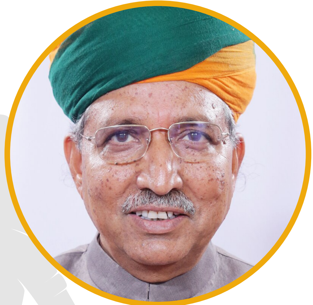
HON'BLE SHRI ARJUN RAM MEGHWAL

HON'BLE GOVERNOR OF HARYANA & CHANCELLOR, DR. B.R. AMBEDKAR NATIONAL LAW UNIVERSITY, SONEPAT