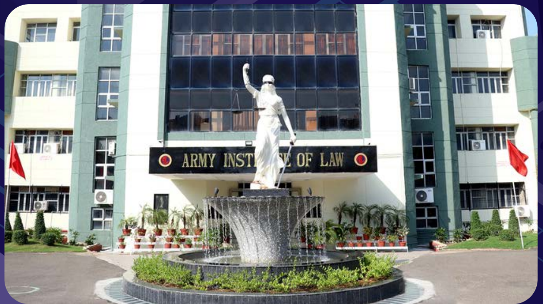
Army Institute of Law, Mohali

The Institute is affiliated to the Punjabi University, Patiala and approved by the Bar Council of India. With 'Aspire & Achieve' as its motto, the Institute has grown as a Centre of Excellence in the field of legal education.