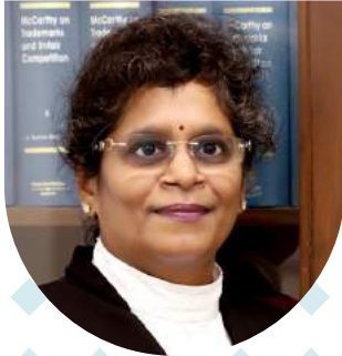
Hon'ble Justice Prathiba M. Singh, Judge, High Court of Delhi