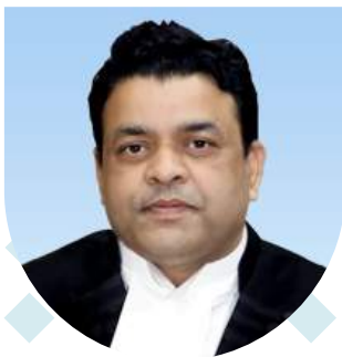
Hon'ble Justice Sanjeeb Kumar Panigrahi, Judge, High Court of Orissa