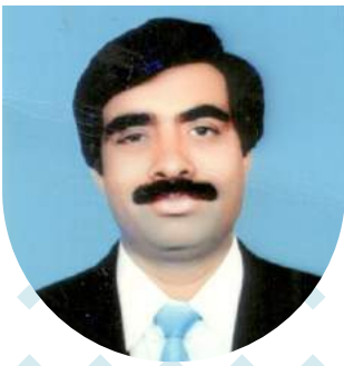
Hon'ble Justice Kaushal J. Thaker, Judge, High Court of Allahabad