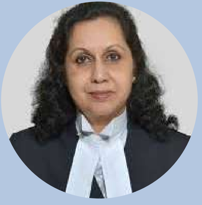
Hon'ble Justice Abhilasha Kumari Judicial Member of Lokpal, India Former Chief Justice, Manipur High Court, India