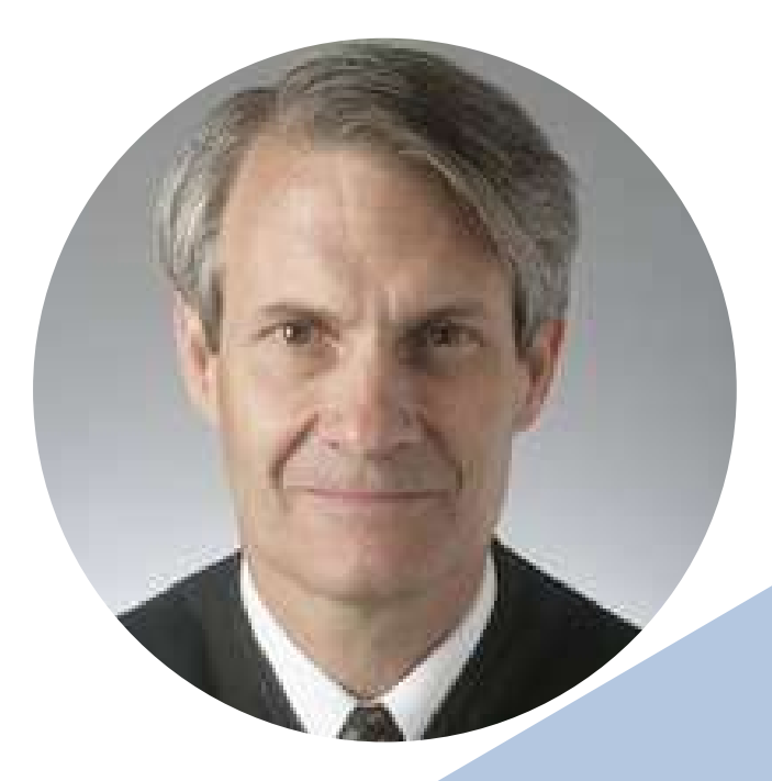
Hon'ble Judge Thomas Griffith Former Judge of the US Court of Appeals District of Columbia Circuit, USA