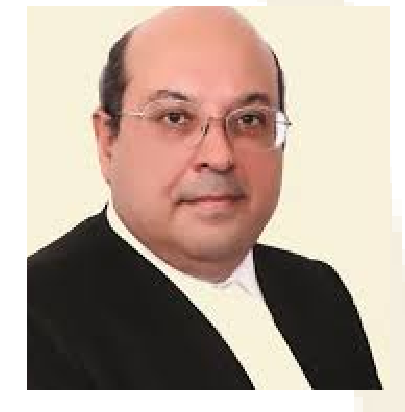
Hon. Justice Rohinton Fali Nariman, Supreme Court of India