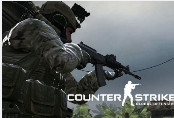
COUNTER STRIKE Rs.100